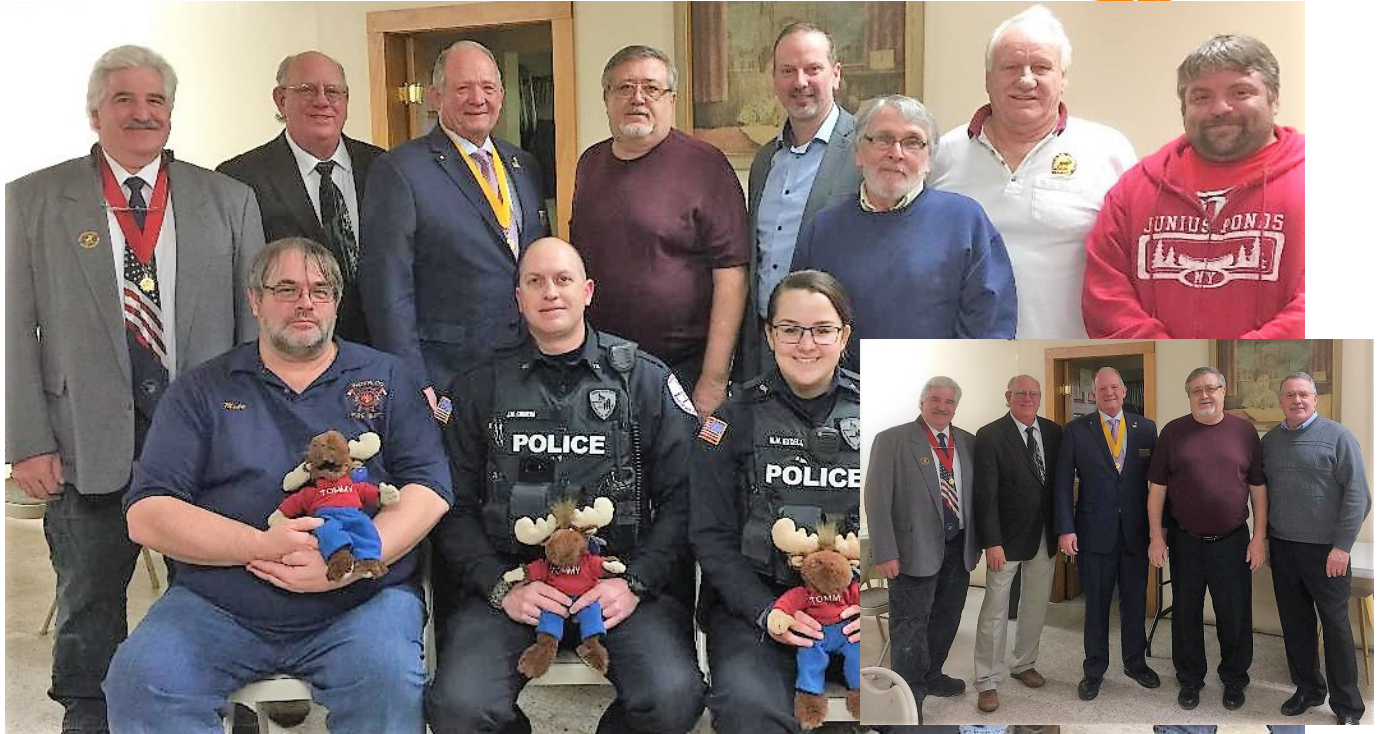
Presentation of Tommy Moose to local Police during the Supreme Governor's visit.